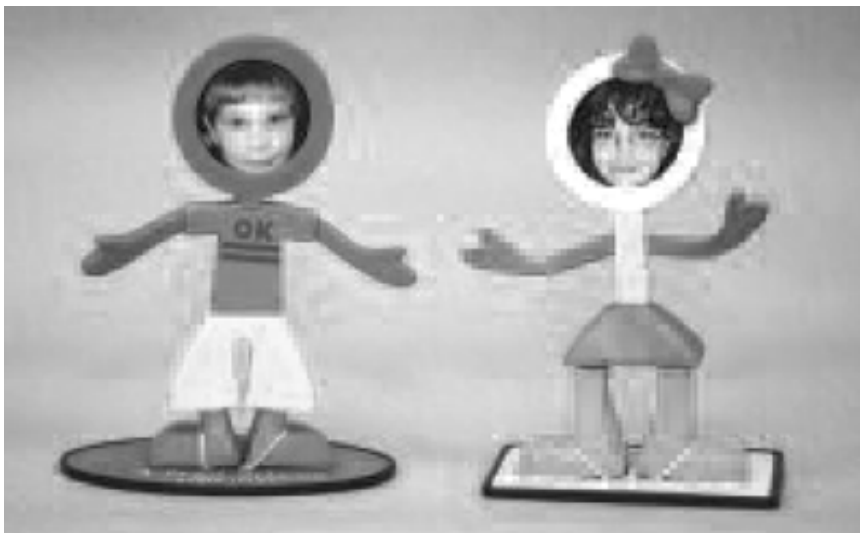
Figure 1. Photo People

To affirm blogging successes, teachers posted student photos, labeled with their blogging success stories.